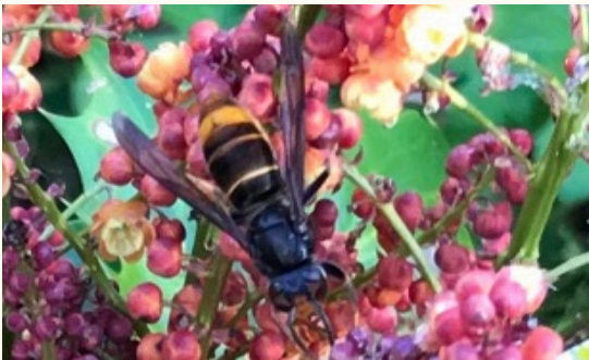
Photo from a confirmed report in Southampton

Map of sightings and nests can be viewed here